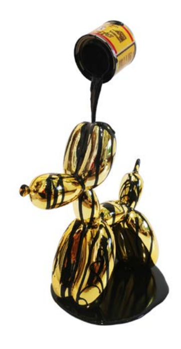
Balloon Puppy (gold and black)

Epoxy Resin, Enamel and Paint Can 15 × 11 × 5 in - 38 × 28 × 13 cm Unique variant