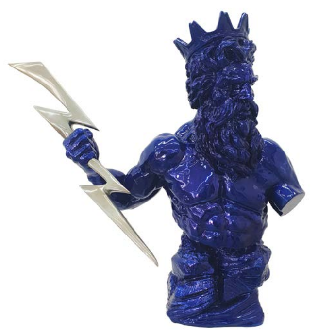
Elegance Is Timeless

Bronze 34 × 14 × 12 in - 86 × 35 × 31 cm Limited edition