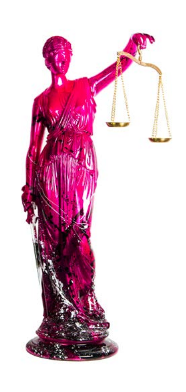
Afro Under Pressure

Mixed media 20 × 12 × 8 in - 52 × 30 × 20 cm Unique