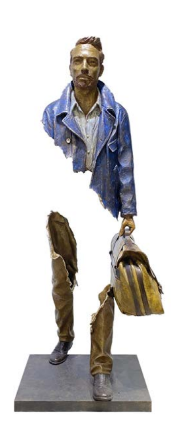
Alessandro Bronze 72 × 31 × 30 in - 182 × 80 × 77 cm Limited edition