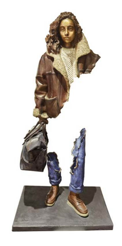
Emilie Bronze 39 × 20 × 15 in - 100 × 50 × 38 cm Limited edition $ 38 000