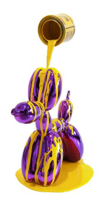
Balloon Puppy (violet and yellow)

Epoxy Resin, Enamel and Paint Can 15 × 11 × 5 in - 38 × 28 × 13 cm Unique variant