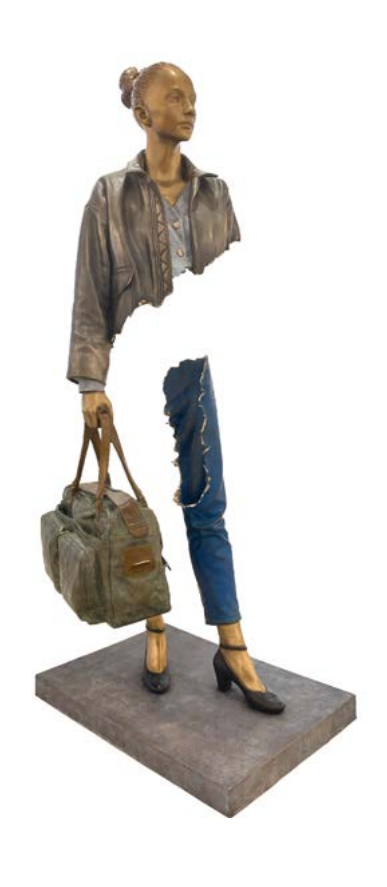
Loulou Bronze 55 x 24 x 18 in - 140 x 60 x 45 cm Limited edition $ 68 000