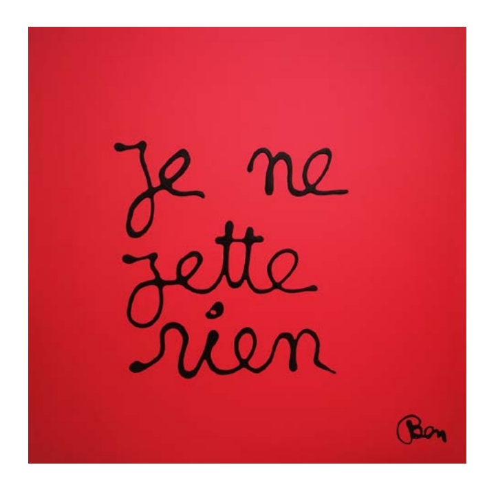
Je Ne Jette Rien

Acrylic on canvas 31 × 31 in - 80 × 80 cm Unique