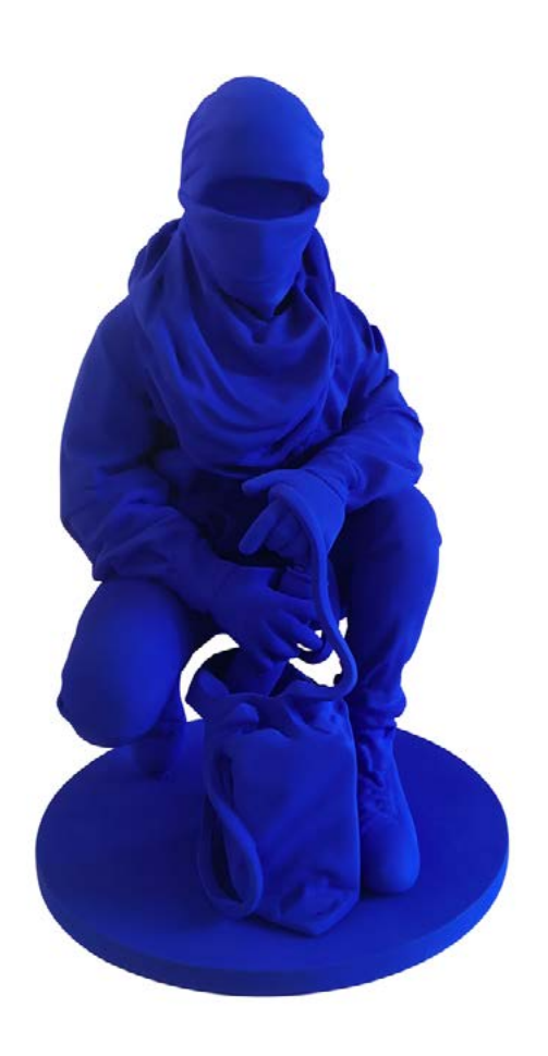
Writer I Resin 24 × 16 × 16 in - 60 × 40 × 40 cm Unique $ 9 500