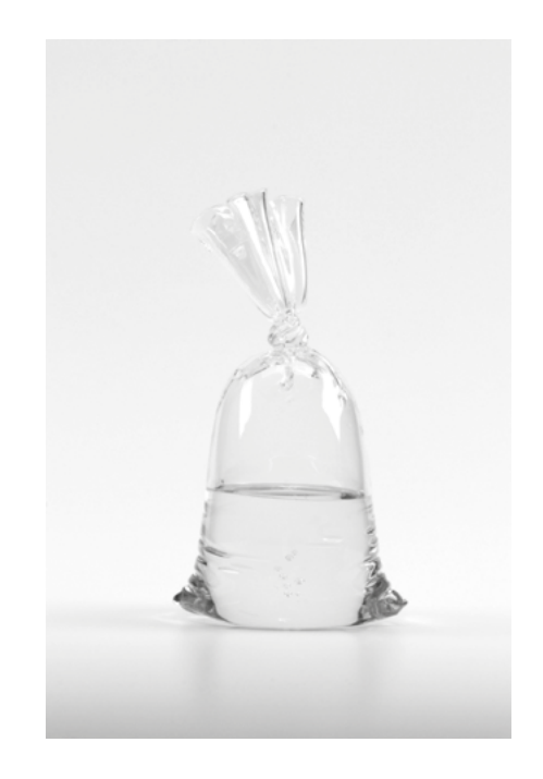
Water Bags (Big) 100% Hot sculpted glass 16 - 17 in | 40 - 44 cm Unique $ 2 500