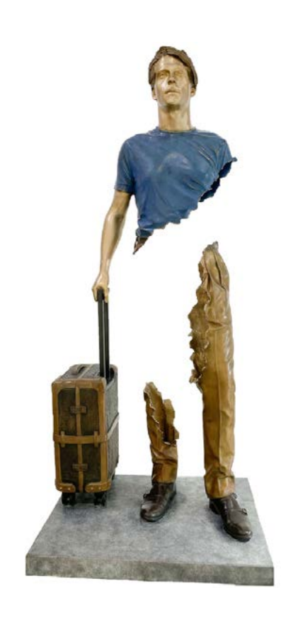
Davide Bronze 57 × 25 × 19 in - 145 × 63 × 49 cm Limited edition $ 68 000