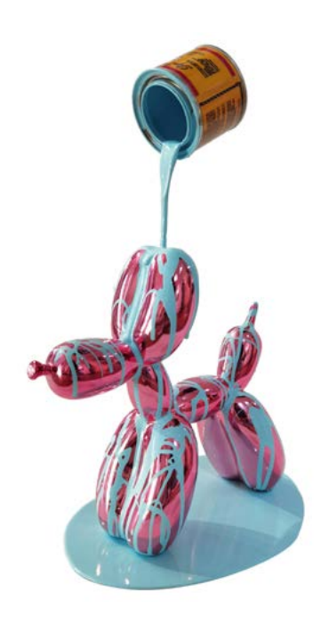
Balloon Puppy (pink and aqua blue)

Epoxy Resin, Enamel and Paint Can 15 × 11 × 5 in - 38 × 28 × 13 cm Unique variant