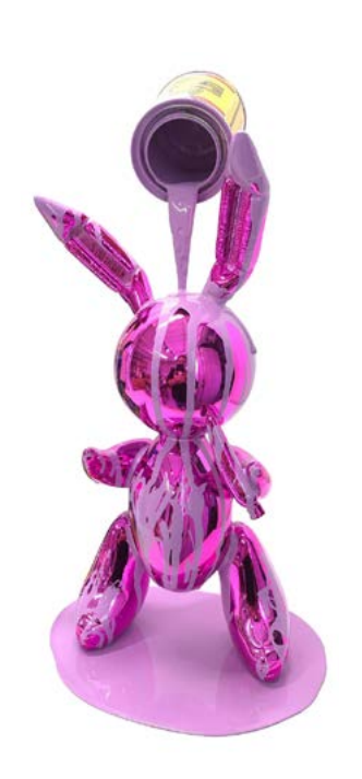
Happy Accident - Rabbit

Epoxy Resin, Enamel and Paint Can 17 x 9 x 7 in - 43.2 × 22.9 × 17.8 cm Unique variant