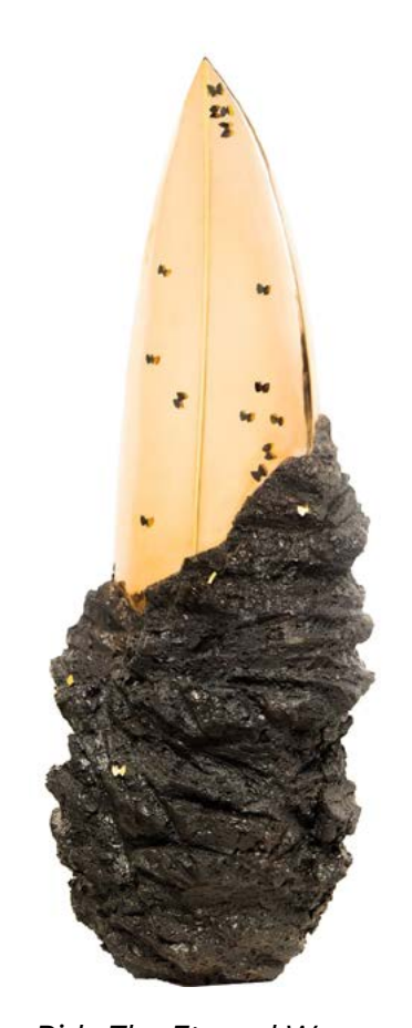
Ride The Eternal Wave Bronze 73 × 29 × 21 in - 186 × 73 × 53 cm Limited edition